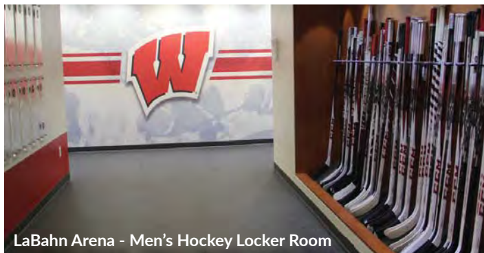
LaBahn Arena - Men's Hockey Locker Room