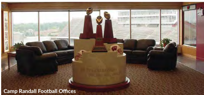
Camp Randall Football Offices