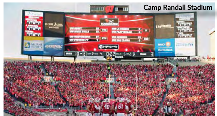
Camp Randall Stadium