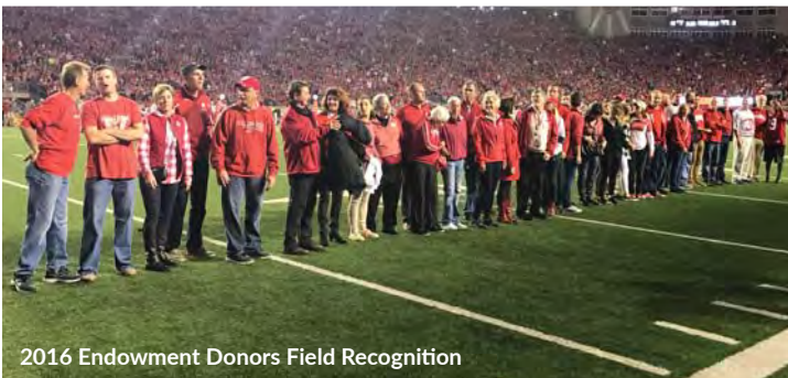
2016 Endowment Donors Field Recognition